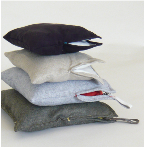
Kissen for etc... creation 2007